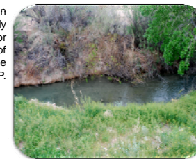
Figure 6 Riparian property on the Muddy River is managed for the purposes of implementing the MSHCP.