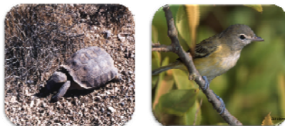
Figure 2 and 3 Two species covered by the MSHCP are federally listed, the Desert Tortoise and the Southwestern Willow flycatcher.

The plan has a 30 year permit term, which started in February 2001, and covers 78 species.