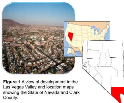
Figure 1 A view of development in the Las Vegas Valley and location maps showing the State of Nevada and Clark County.

HCPs can be developed on a project by project basis, or can be developed regionally.