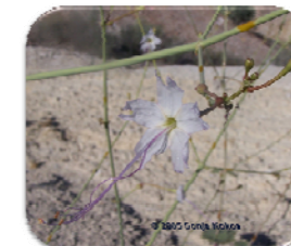
Figure 9 Sticky ringstem is a plant covered by the MSHCP.