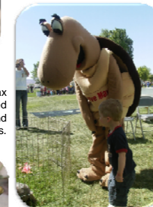
Figure 8 Mojave Max is a character created for public outreach and education purposes.