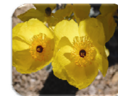
Figure 7 The Las Vegas Bearpoppy is a Nevada state listed plant covered by the MSHCP.